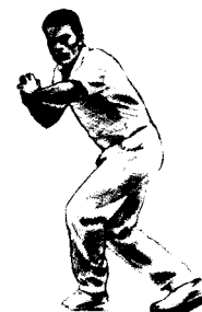
Fig.5 Strong throwing position established. Target sighted. See page 1.3, Fig.2.