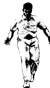
Fig.2 Fielder assesses line of ball and moves at speed onto a line slightly to the non-throwing side of the ball.