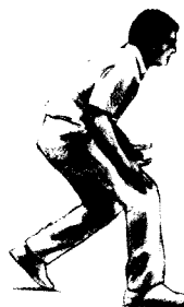
Fig.1 Fielder approaches ball in a balanced, aggressive manner taking short strides. As the ball is played, the fielder should be perfectly balanced, in a low crouched position, weight on the balls of the feet, with the head still and eyes level. Experience may allow a certain amount of anticipation.