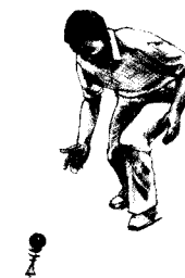
Fig.3 Ball is picked up between the feet. Head over the ball, knees flexed, body and hands low. Side on to the target. Watch the ball.